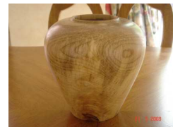
A nicely grained green-wood Sycamore Vase. (150mm dia x 158mm h). Made 2008.

The second new area is DW Sweats, a 'T' shirt, hoodie etc shop. I am open to suggestions for designs, if you have your own logo, club badge or whatever I can convert the graphic to a suitable format at a very reasonable price. It does take a fair bit of work getting them suitable for use, and keeping the design aspect right.