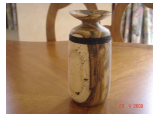
Sumach Vase — An unusually striking wood, Freshly cut and made into a vase. (75mm dia x 162mm h). Made 2008.