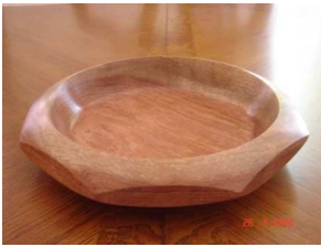
A nicely contrasting piece of Bubinga turned into an octagonal bowl. (180mm dia x 37mm h). Made 2008.

This aspect of turning seemed very subdued when I first heard of it but suddenly seems to have hit the forefront again. Everywhere you go it seems someone is venturing into this realm. Again a new aspect to me so it caught my attention. Back to the web looking for the way to do it and any tips or examples I could have a go at. Loads out there but by far the best link I found was http://www.segmentedturning.com/ . There are several sites around that offer programs to aid in planning and cutting your segments but to me this was the best presented. I took the plunge and purchased my registration. I am now trying to design a turning of some sort that uses the woods I have in stock. Not an easy thing this Design World. The problem with this type of program is that it gives you an idea of what the finished item should look like. Hence I