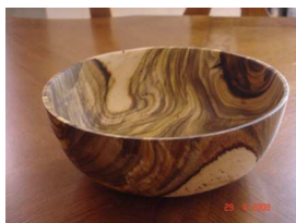
Sumach Bowl — Cut from the same piece as the vase. A really nice patterning. (160mm x 60mm h). Made 2008.

I have to admit, this is the first time I have been to Woodex. I was impressed. Talking to the traders and the demonstrators I think it was universally agreed that this was by far the best attendance they have had to date. I assume the word is getting around. The added bonus is FREE ENTRY. I can only hope that oth-