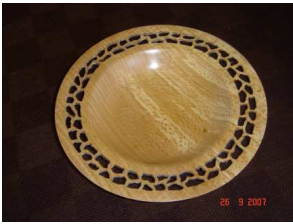
One of my attempts at piercing work. Pierced yet functional, a compromise between functional or decorative, it works for me.

Last issue I mentioned a few things mainly connected with my website which I can update you on now they have been running a couple of months.