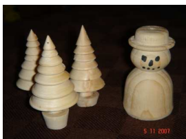
Christmas ornaments. The season fast approaches so get the old bits of wood out and turn the ornaments, get the kids to colour/paint them.

Frightening as it is why not get the old odd bits of wood out and get turning some Christmas Ornaments. You can make anything that you put your mind and chisel too, tree's, snowmen, angels it doesn't really matter.