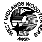
West Midlands Woodturners Badge

Enter the Chairman's Challenge and you could win the £25 voucher for the overall yearly winner, to spend at the Earlswood Interiors shop as well.